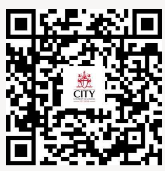
Scan the QR code to be added to City's mailing list to hear about our Open Days, taster sessions, course information and more