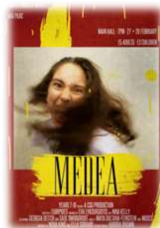
Poster for Medea