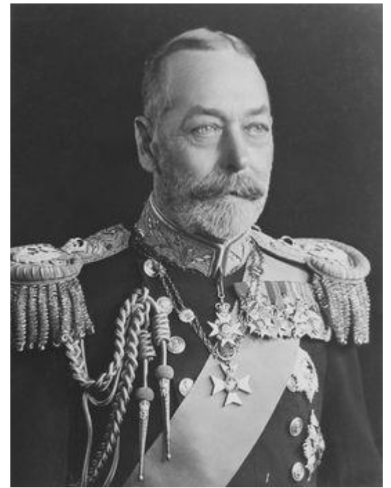
King George V - he wanted to have two minutes silence