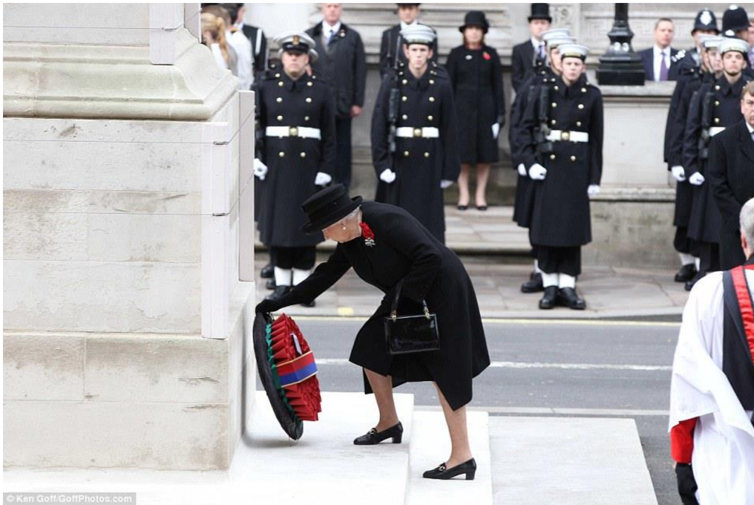
The Queen laying a wreath at the Cenotaph in a recent memorial service