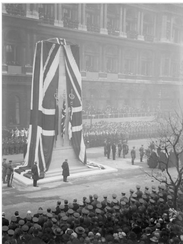
Left - King George V unveiling the permanent Cenotaph in Whitehall on 11th November 1920