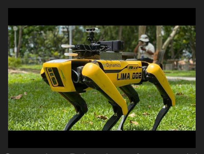
Coronavirus: Robot dog enforces social distancing in Singapore park

Thank you to the 157 students who responded to my survey before half term