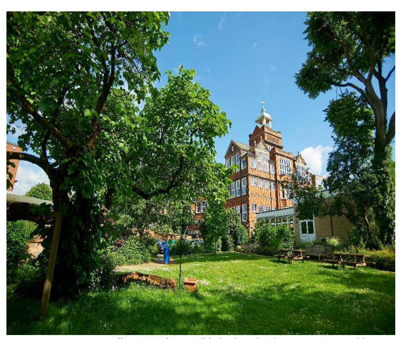
By supporting our Excellence Fund you will help the school continue its proud history and exceptional results.

Camden School for Girls is consistently identified as one of the top performing state schools in the country and we are very proud of its achievements over the past 150 years. But it is hard to imagine a time in our long history when our finances have been under as much pressure as they are now. We urgently need your support to help us to continue to provide the best education that we can for all our pupils.